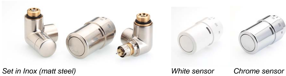
Set in Inox (matt steel)

For the towel-rail and design radiator market